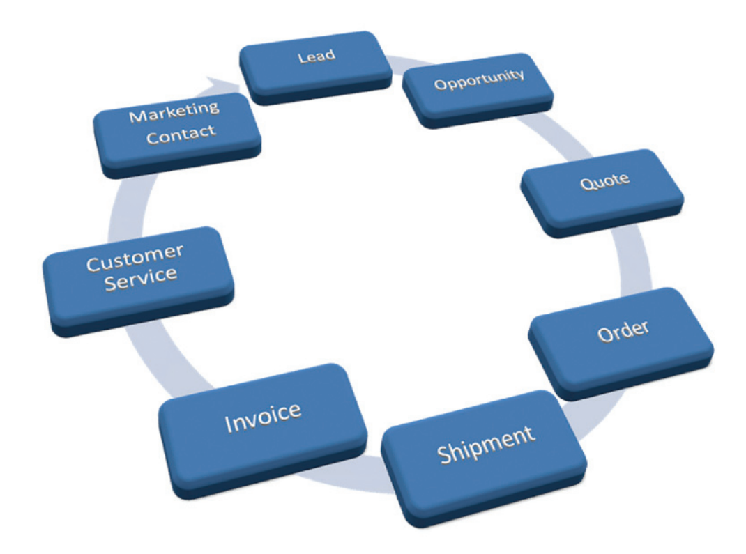
SageCRM front to back office full process automation

The following diagram illustrates the uninterrupted, optimized, cost-efficient, and customer-centric front to back office process flow that SageCRM provides.