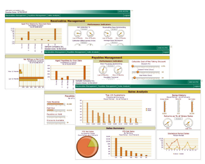
Accounts Payable, receivable and Sales Analysis dashboards